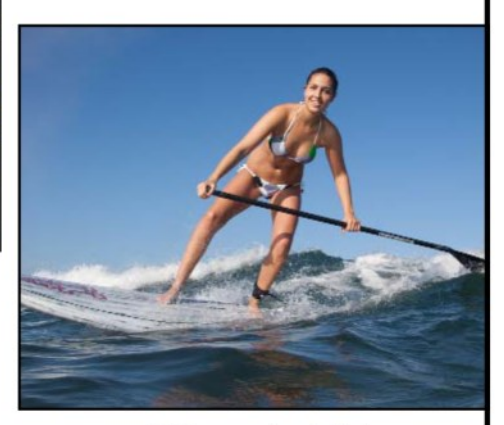
Stand UP Paddling Lessons, Rentals, Sales

Rafts, rafts on trailers rigged and ready to go Kayaks, Canoes, Duckies, Stand up paddleboards