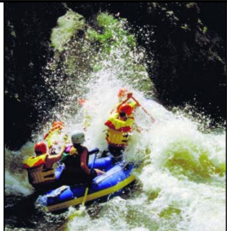
Raft Trips! Over 70 Discounted Raft Trips! Spread the word! Sign-up online